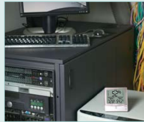
Alerts low Humidity levels in Computer rooms to help prevent electrostatic conditions.