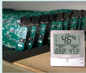
Indicates Humidity and Temperature levels in Production areas.