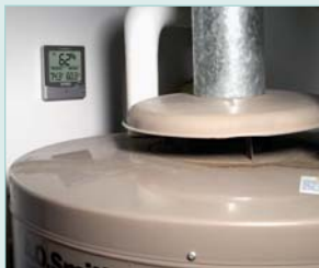
Monitoring Dew Point levels in a Basement for potential mold growth.