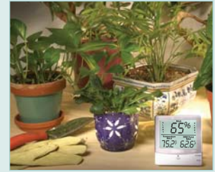
Checks the Humidity and Temperature levels for optimal plant growth in greenhouses.